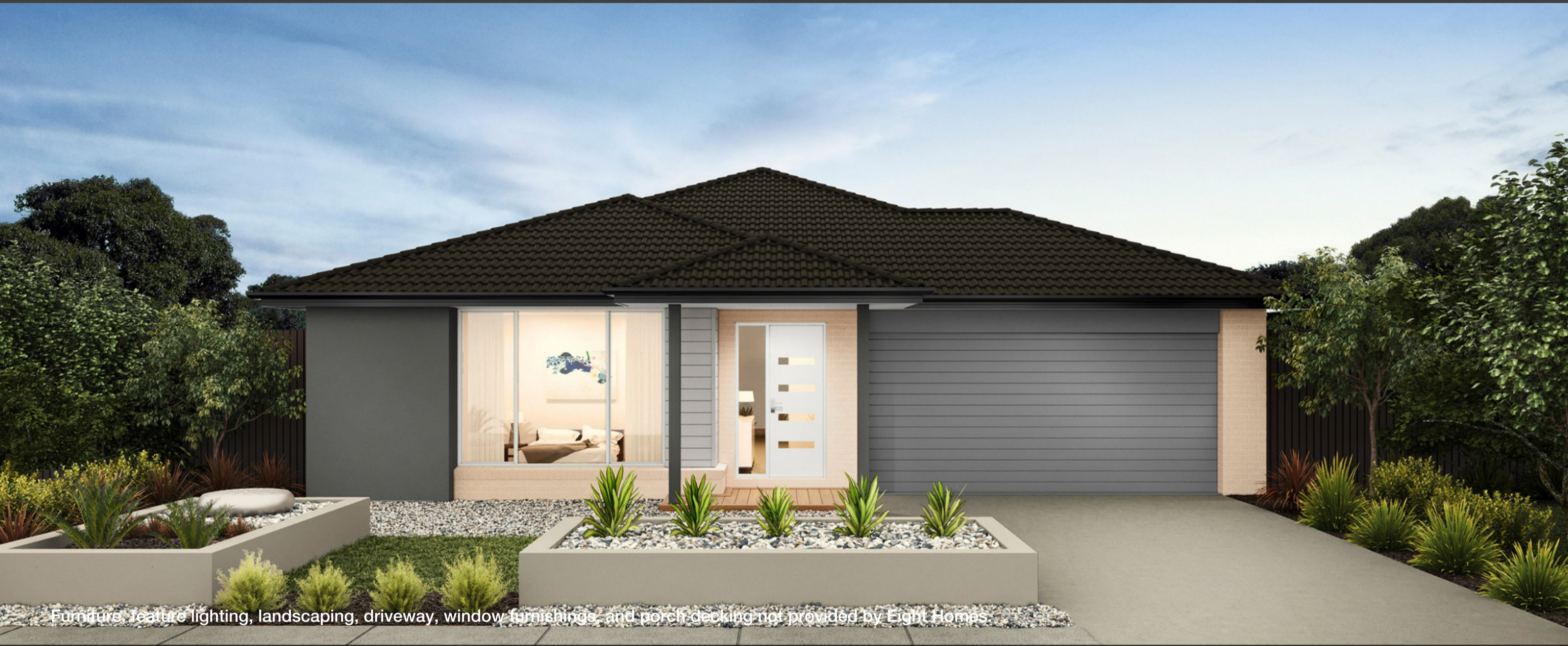
Furniture, feature lighting, landscaping, driveway, window furnishings, and porch decking not provided by Eight Homes.

Price includes standard floorplan with S1 facade.