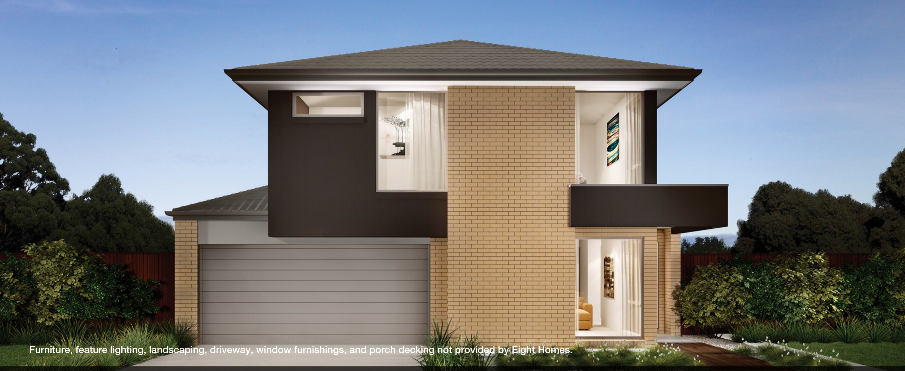
Furniture, feature lighting, landscaping, driveway, window furnishings, and porch decking not provided by Eight Homes.

Price includes standard floorplan with S1 facade.