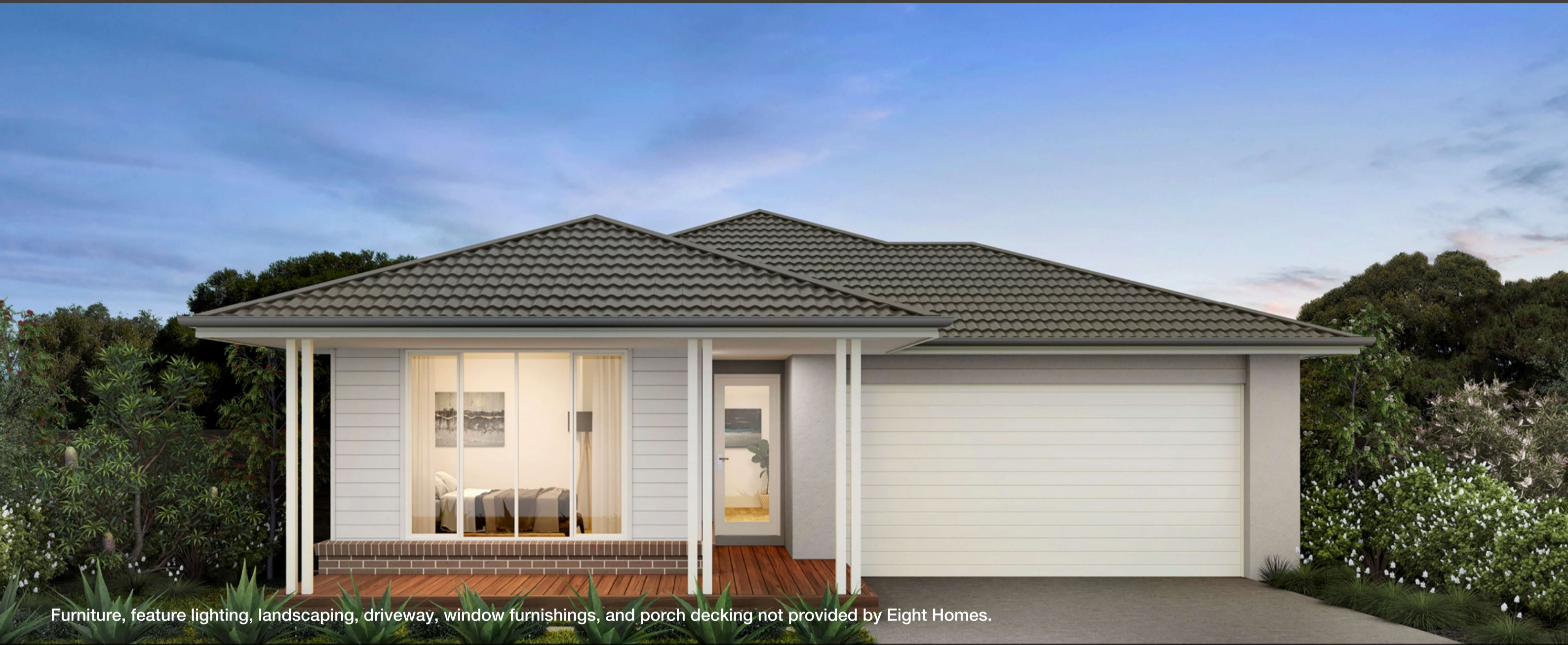
Furniture, feature lighting, landscaping, driveway, window furnishings, and porch decking not provided by Eight Homes.

Price includes standard floorplan with S1 facade.