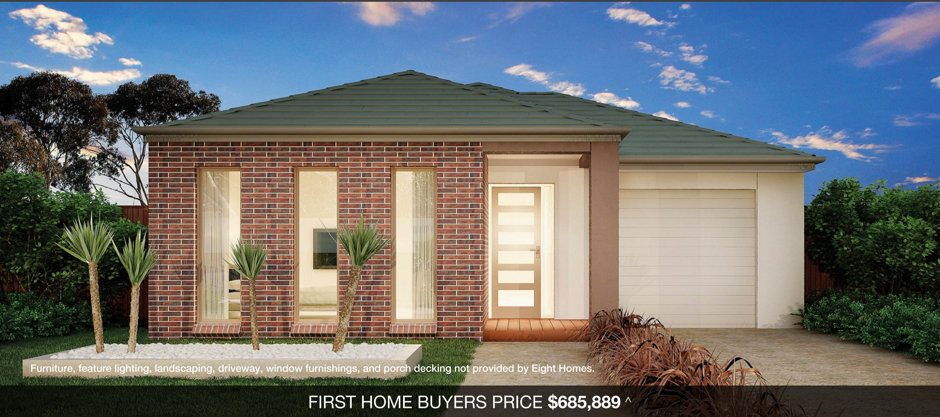
Furniture, feature lighting, landscaping, driveway, window furnishings, and porch decking not provided by Eight Homes.

Price includes standard floorplan with S1 facade.