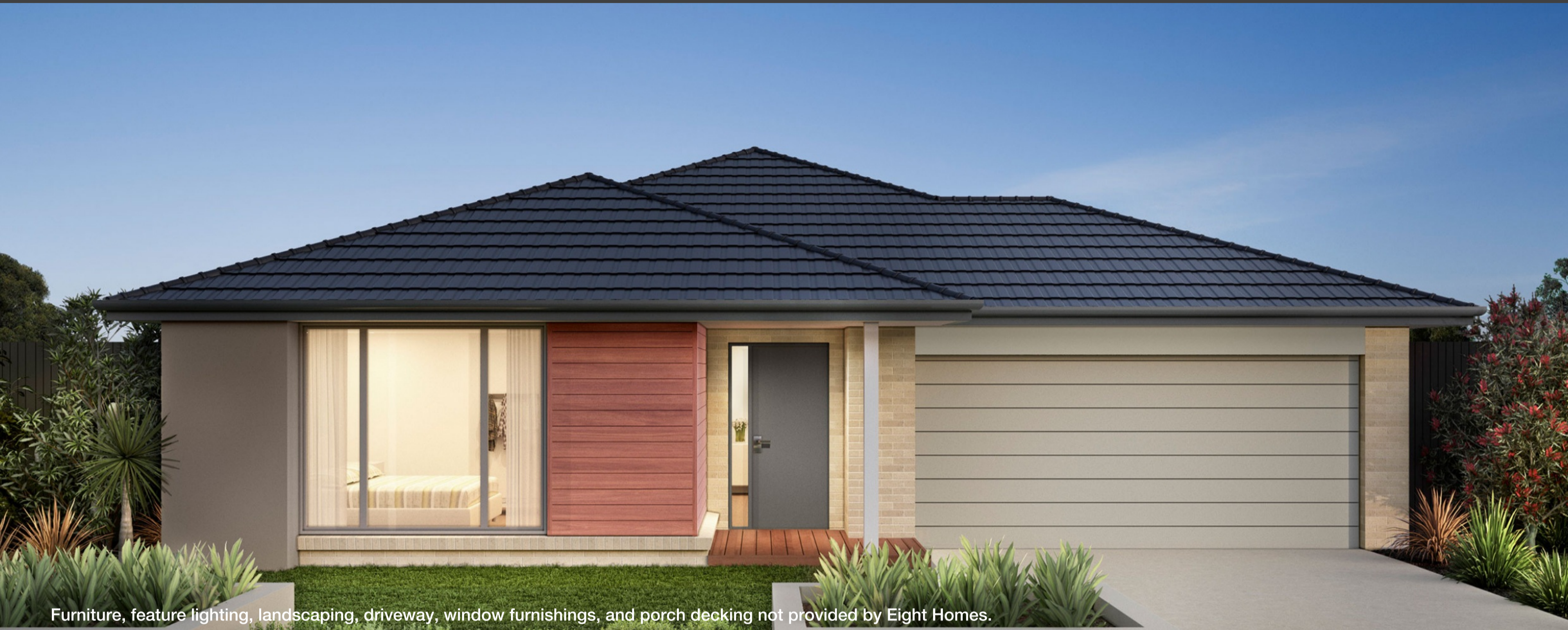
Furniture, feature lighting, landscaping, driveway, window furnishings, and porch decking not provided by Eight Homes.

Price includes standard floorplan with S1 facade.