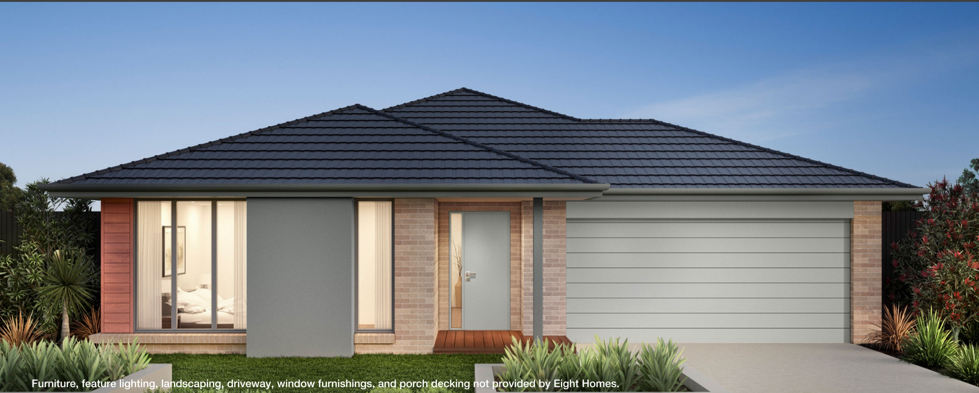
Furniture, feature lighting, landscaping, driveway, window furnishings, and porch decking not provided by Eight Homes.

Price includes standard floorplan with S1 facade.