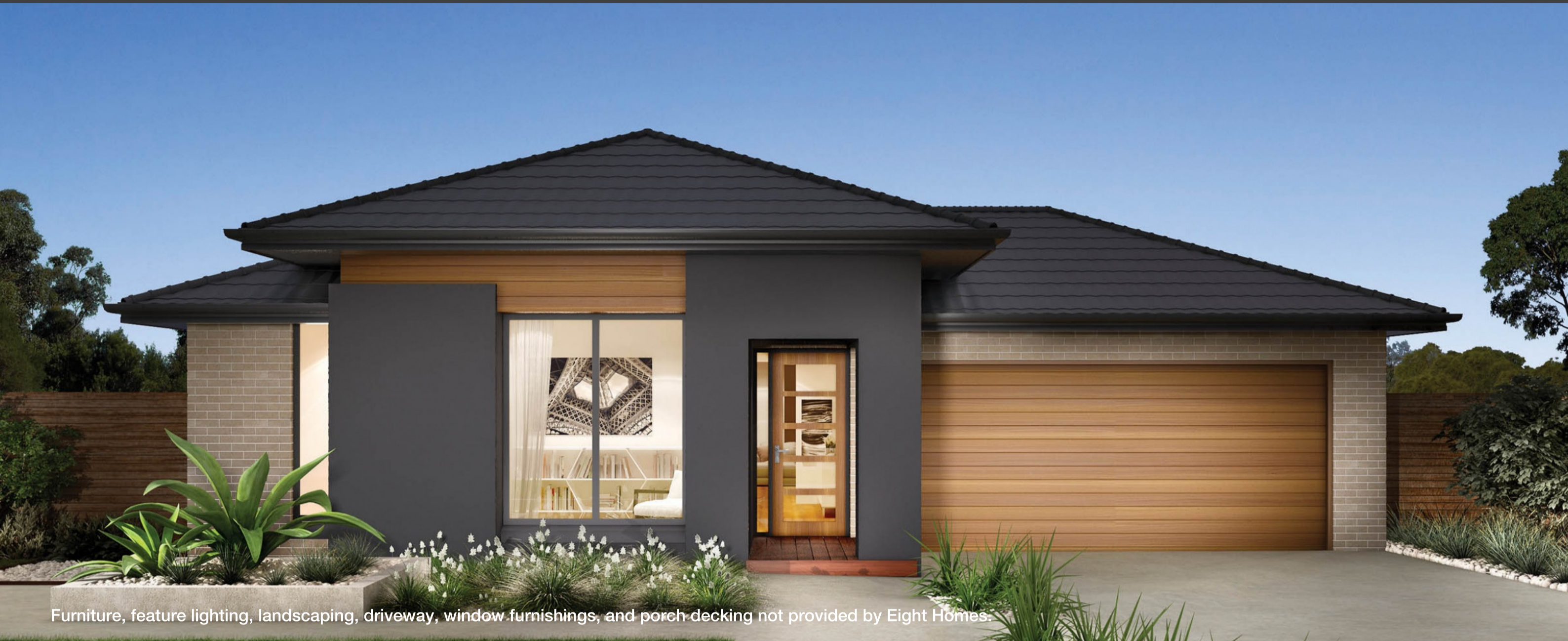
Furniture, feature lighting, landscaping, driveway, window furnishings, and porch decking not provided by Eight Homes.

Price includes standard floorplan with S1 facade.