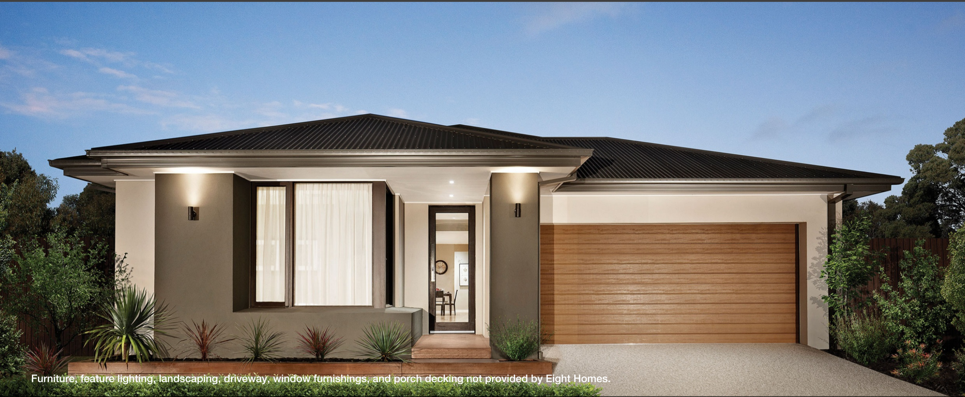
Furniture, feature lighting, landscaping, driveway, window furnishings, and porch decking not provided by Eight Homes.

Price includes standard floorplan with S1 facade.