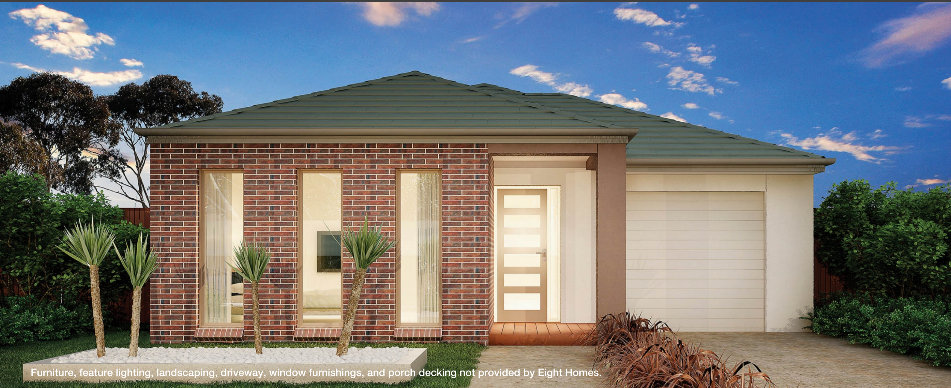
Furniture, feature lighting, landscaping, driveway, window furnishings, and porch decking not provided by Eight Homes.

Price includes standard floorplan with S1 facade.