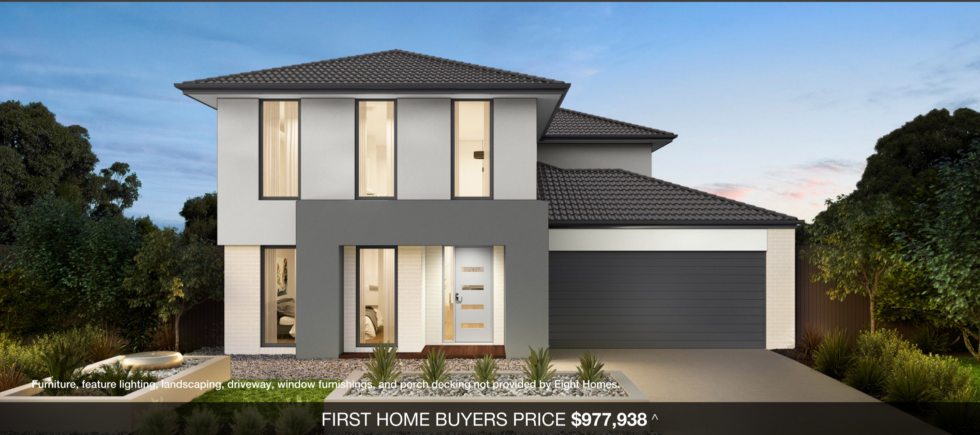
Furniture, feature lighting, landscaping, driveway, window furnishings, and porch decking not provided by Eight Homes.

Price includes standard floorplan with S1 facade.