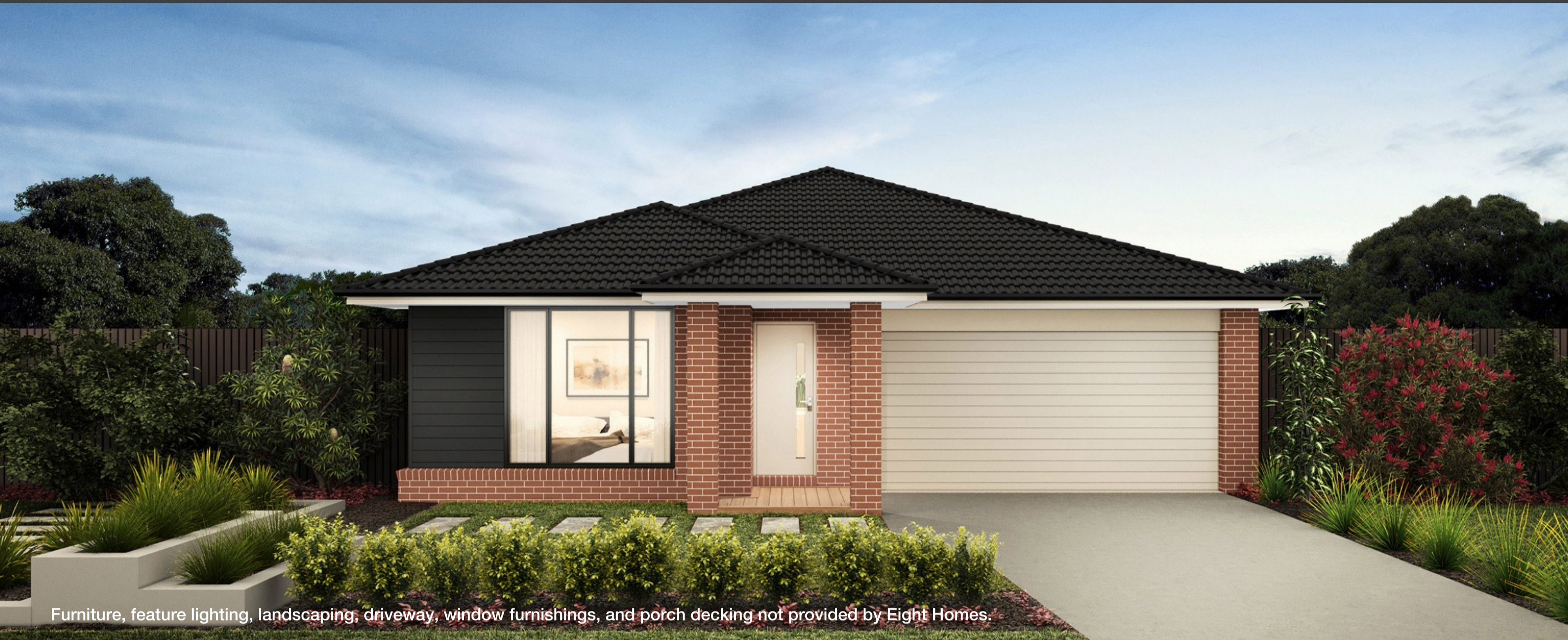
Furniture, feature lighting, landscaping, driveway, window furnishings, and porch decking not provided by Eight Homes.

Price includes standard floorplan with S1 facade.